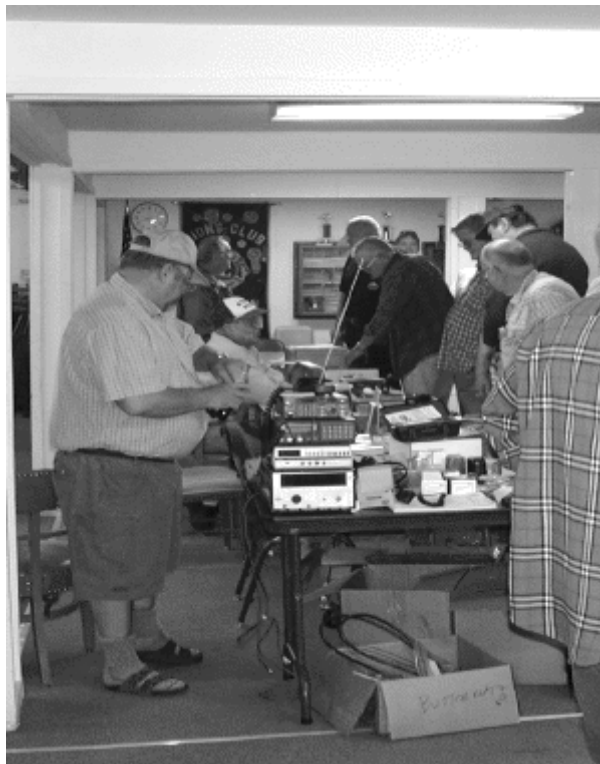
Bargain hunters...and more old goats