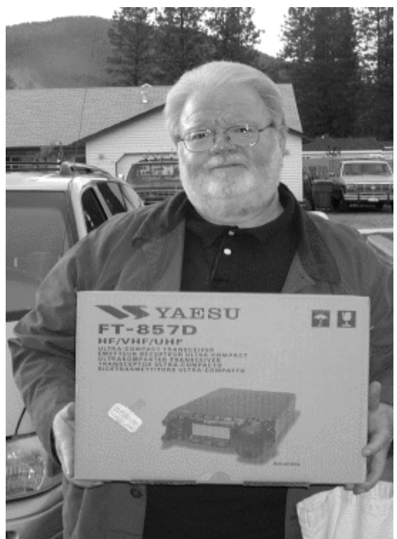
Grand prize winner (rigged contest ?)